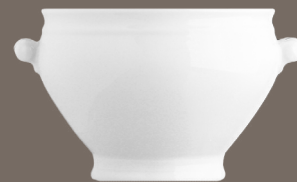
DIV9850 soup bowl 50 cl