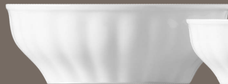
SPZ1424 bowl 24 cm