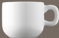
BEN0825 cup 25 cl