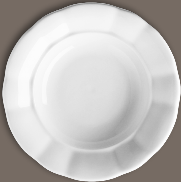
BEN1924 deep plate 24 cm