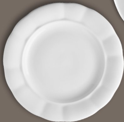
BEN2119 plate 19 cm