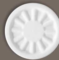
BEN3036 oval plate 36 cm