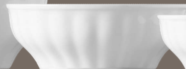
SPZ1419 bowl 19 cm