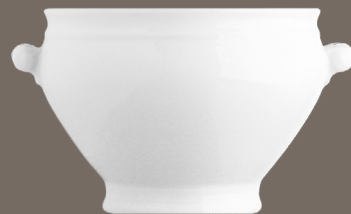
DIV9870 soup bowl 70 cl