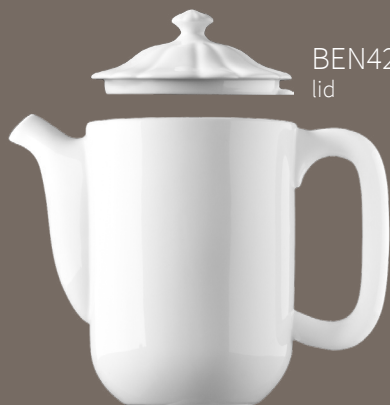
BEN4010 pot 100 cl