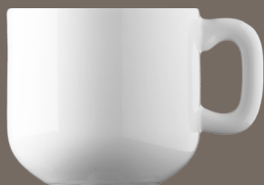
BEN0640 mug 40 cl